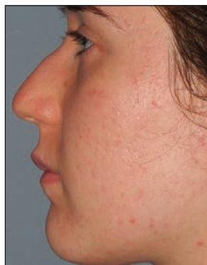
Acne before and after treatment with DefenAge

efficacy and mechanism of DefenAge has been well-demonstrated. 1